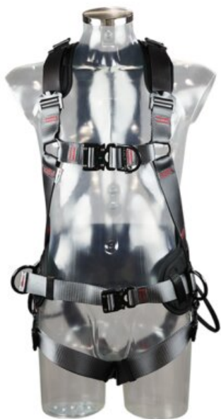
Work positioning D-ring